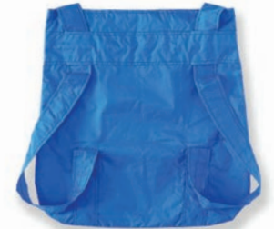
Pull handles down to use as back pack.