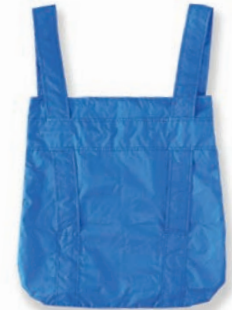
Pull handles up to carry as tote.