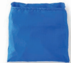
Fold into pocket to store.