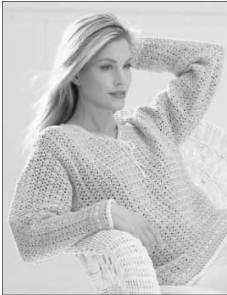
Patons® Grace V-NECK TUNIC