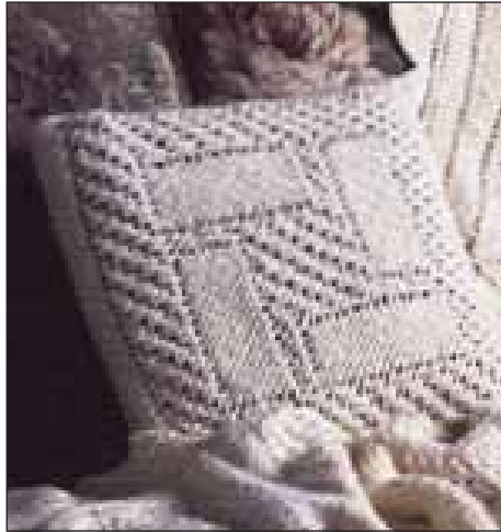
Trellis Square Pillow (to knit)