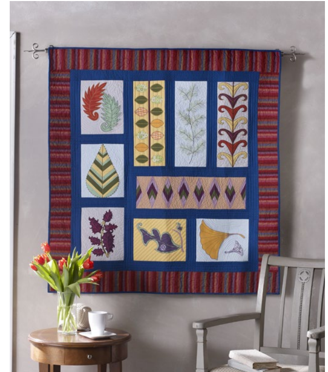
Finished Wall Hanging