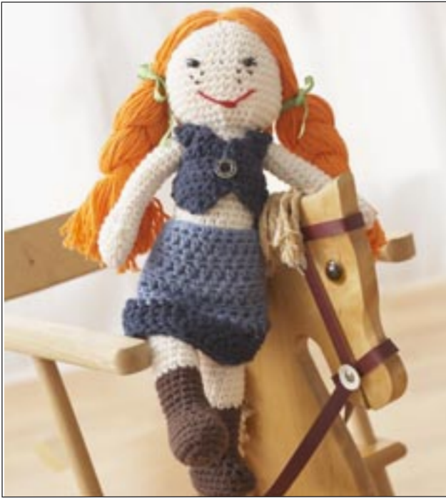
DENIM DOLL (TO CROCHET) LILY® SUGAR N' CREAM