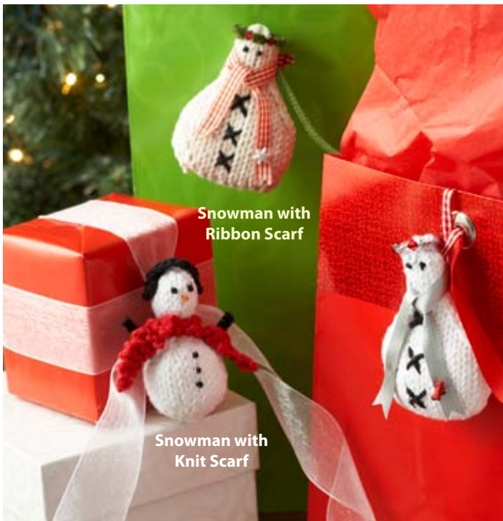
Snowman with Ribbon Scarf