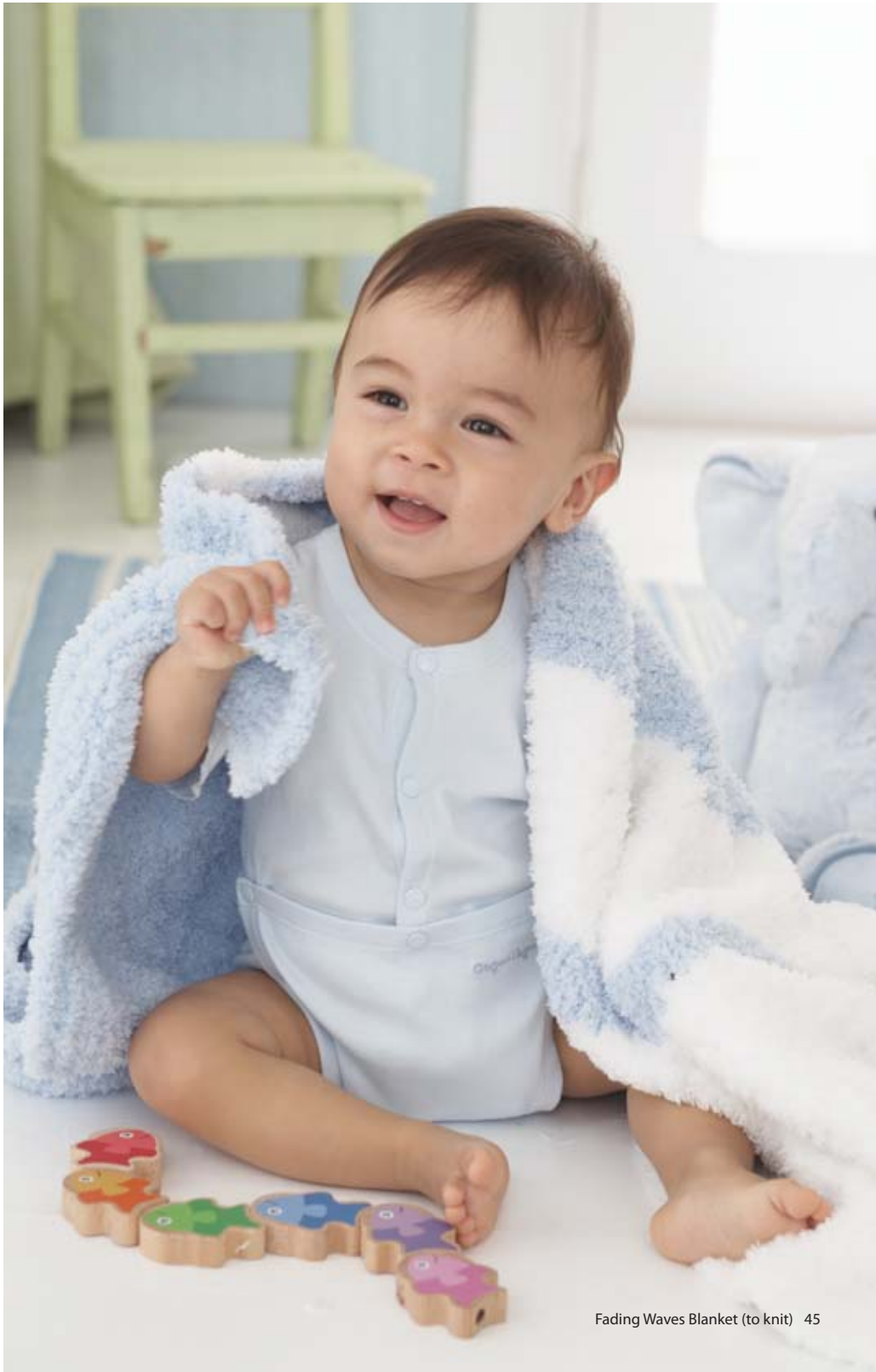
Fading Waves Blanket (to knit) 45