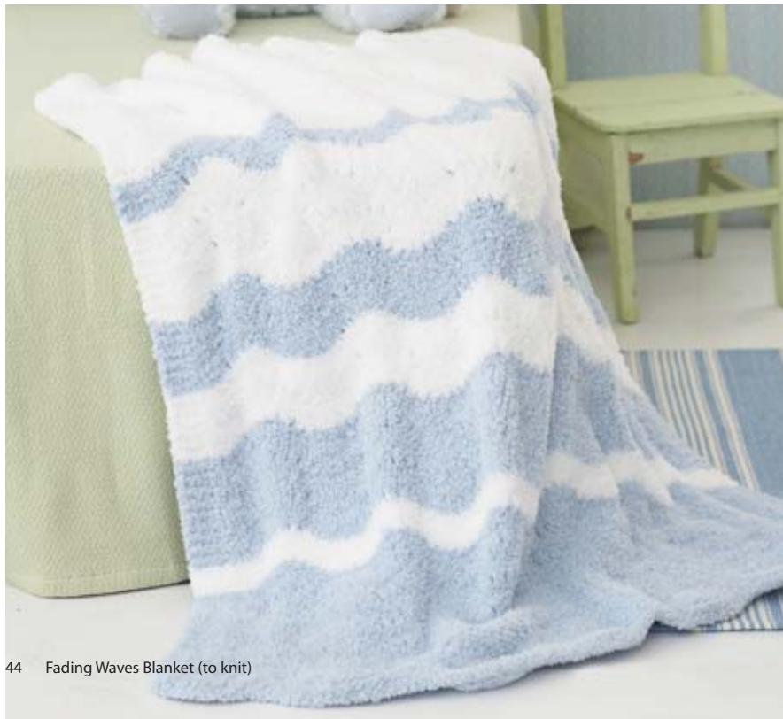
44 Fading Waves Blanket (to knit)