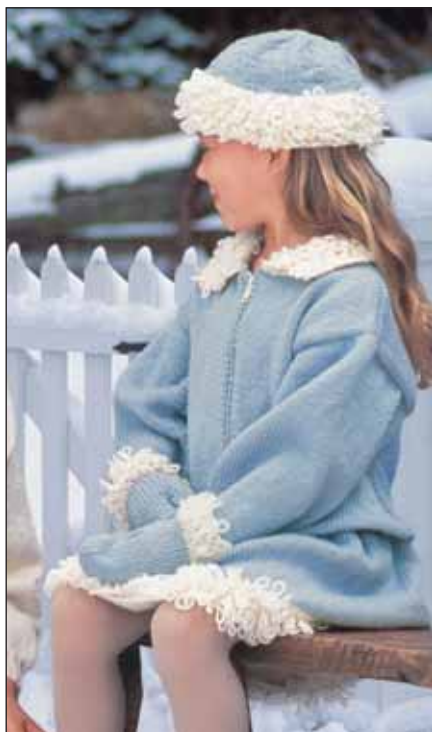
GIRL'S LOOP TRIM JACKET, SKIRT, HAT & MITTS