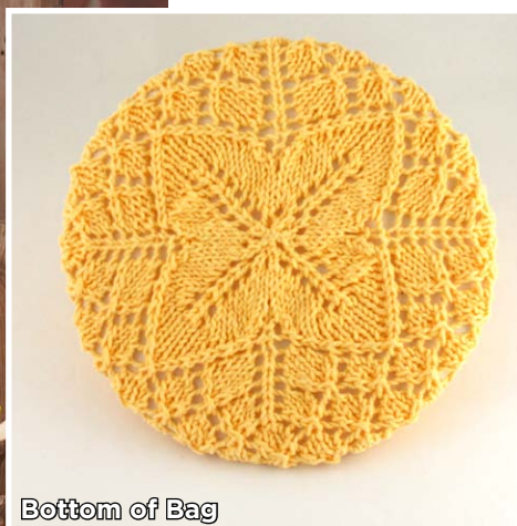
Bottom of Bag