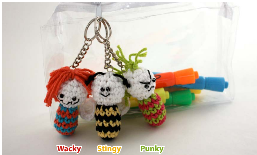
Wacky Stingy Punky