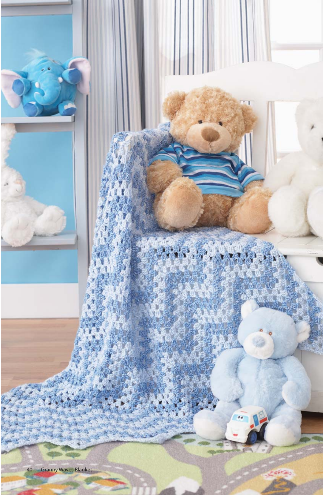
40 Granny Waves Blanket