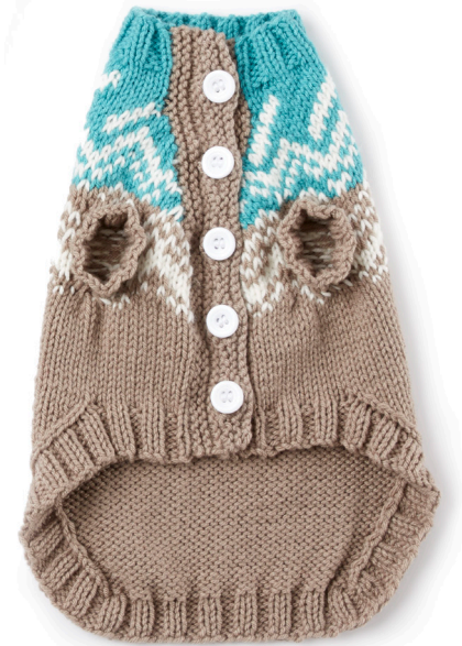
Chart I Size S